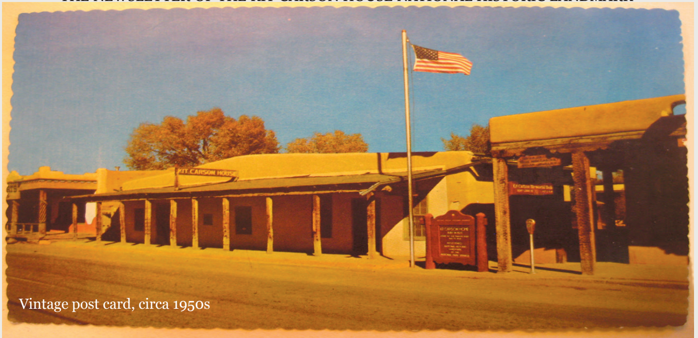
Vintage post card, circa 1950s

THE NEWSLETTER OF THE KIT CARSON HOUSE NATIONAL HISTORIC LANDMARK