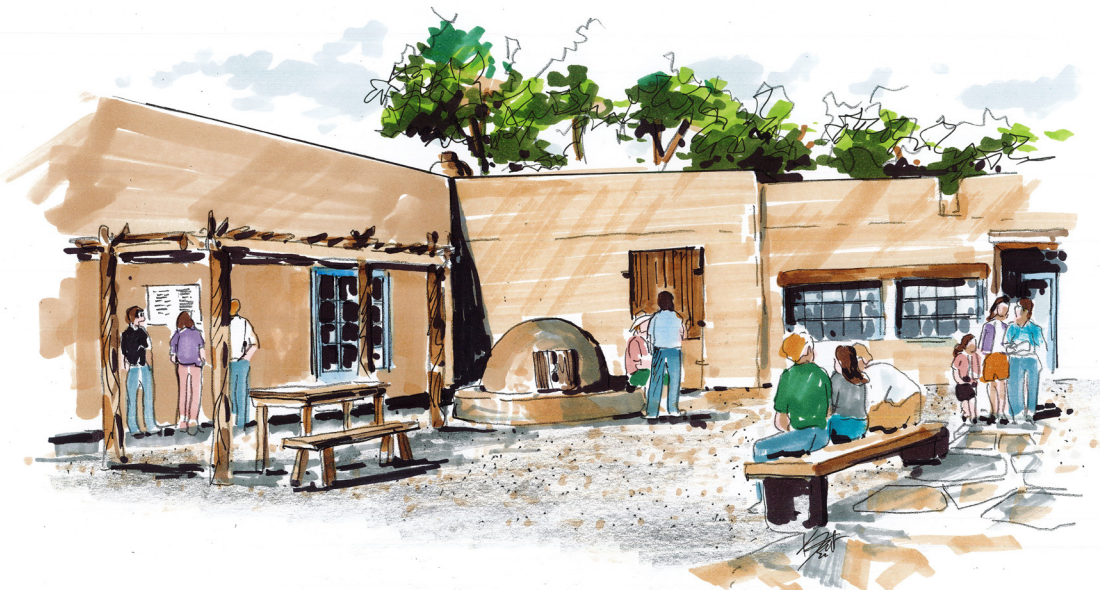
Graphic projection for the future look of the KCH courtyard by Conron & Woods

The rehabilitation of KCH will begin in the courtyard where architects have stressed that drainage is crucial. The courtyard will be graded away from the adobe structures so that moisture is directed toward a drainage system. Because moisture is the enemy of adobe, this is an important first step in protecting and preserving the buildings. As parts of the property are disturbed, there will be an archaeological review of any artifacts uncovered.