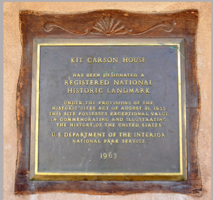
National Historic Landmark plaque